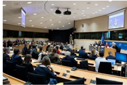
EPAA 20th Anniversary Achievements